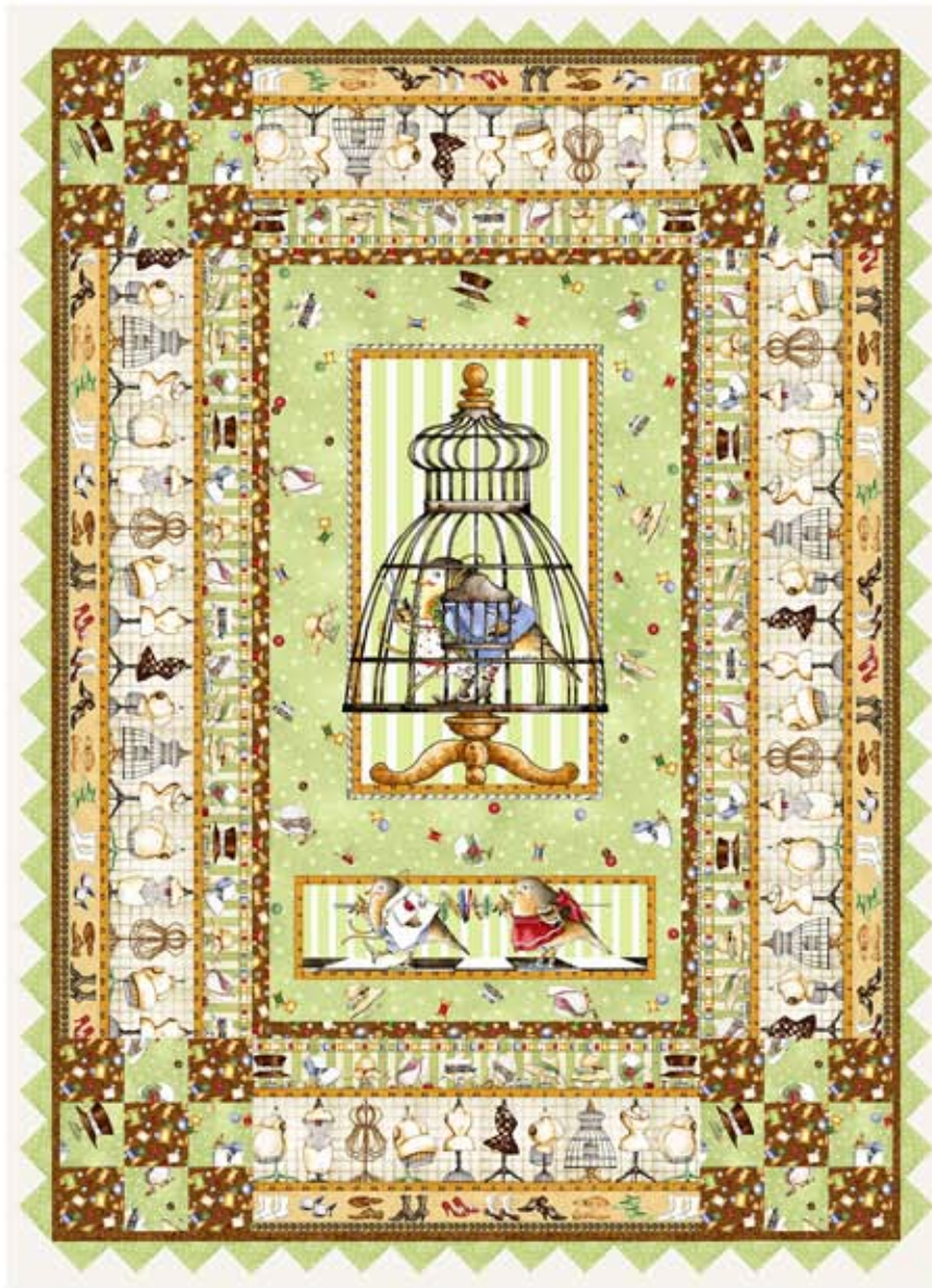
Approximate Finished Size: 56" x 76", including prairie points