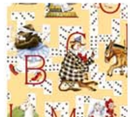
21002 S 3¾ yds