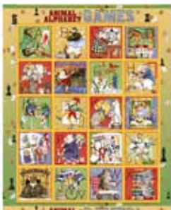
21100 S 1 panel