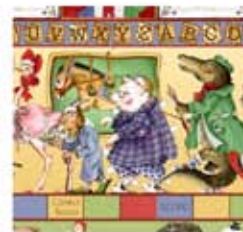
21001 H 3¾ yds