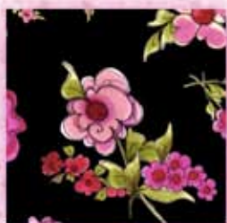
21232 J (backing)