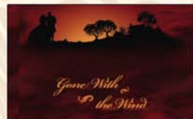
21285 M (backing)