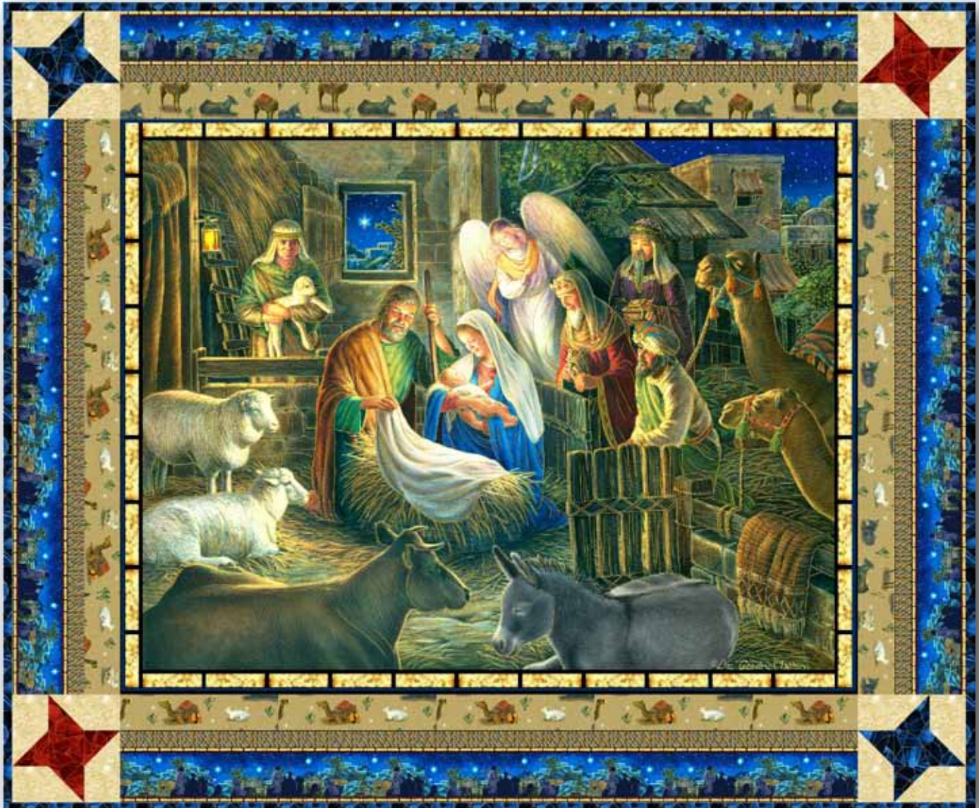
Finished quilt size: 53" x 44"