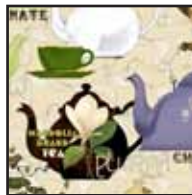
22418 E (Backing)