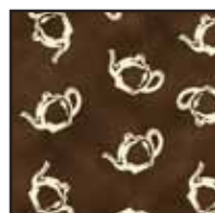
22421 A (Binding)