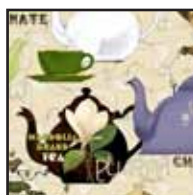
22418 E (Backing)