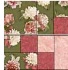
← Top half of block.

Sew a Fabric F 4 1/2" square to the left side of a unit d. This is the top half of the block. Now sew a rotated unit d to the left side of a rotated unit e as shown for the bottom half. Sew the top half to the bottom half to complete the block. Make 4.