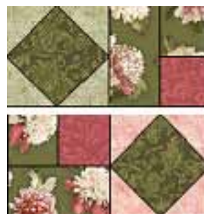
← Top half.

Using remaining strip sets and directions for the Keyboard block, make (2) units d. Sew a unit d to the right side of a Fabric G/D Square in a Square Triangle to complete top half of the block. Sew a rotated unit d to the left side of a Fabric E/D Square in a Square block for the bottom half of the block. Sew the top half to the bottom half to complete block. Make 4.