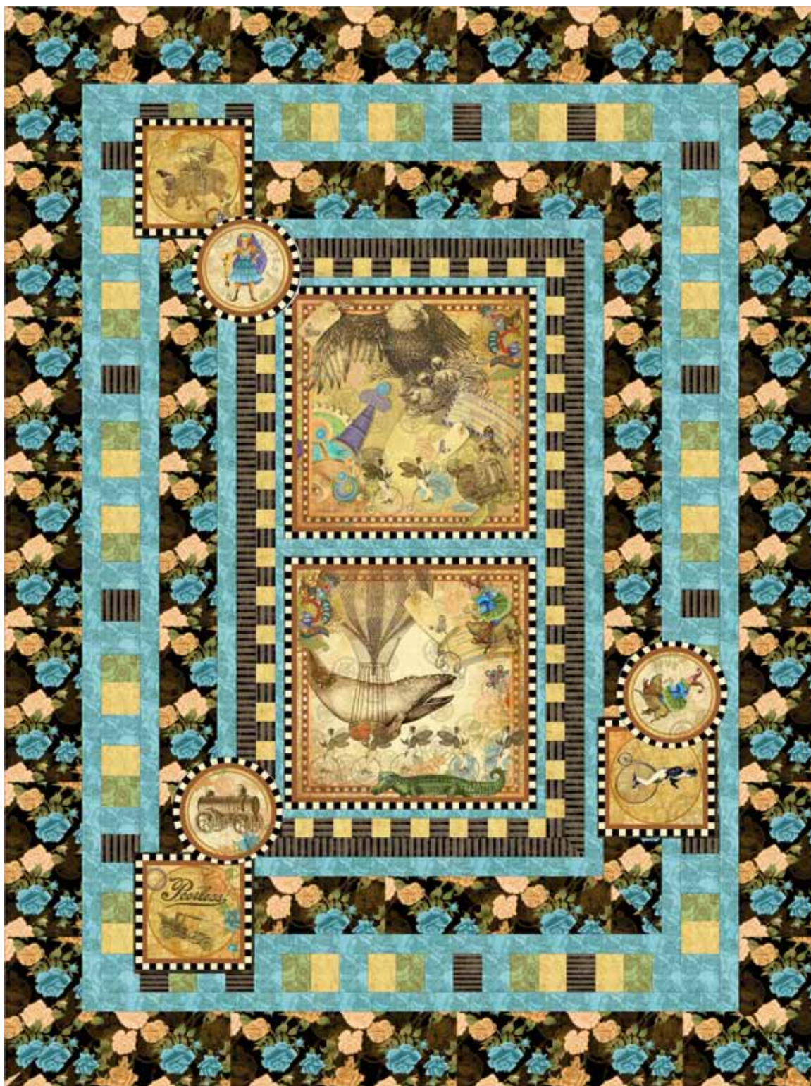
Designed By: Lisa Pompa Finished Quilt Size: 44" x 58"