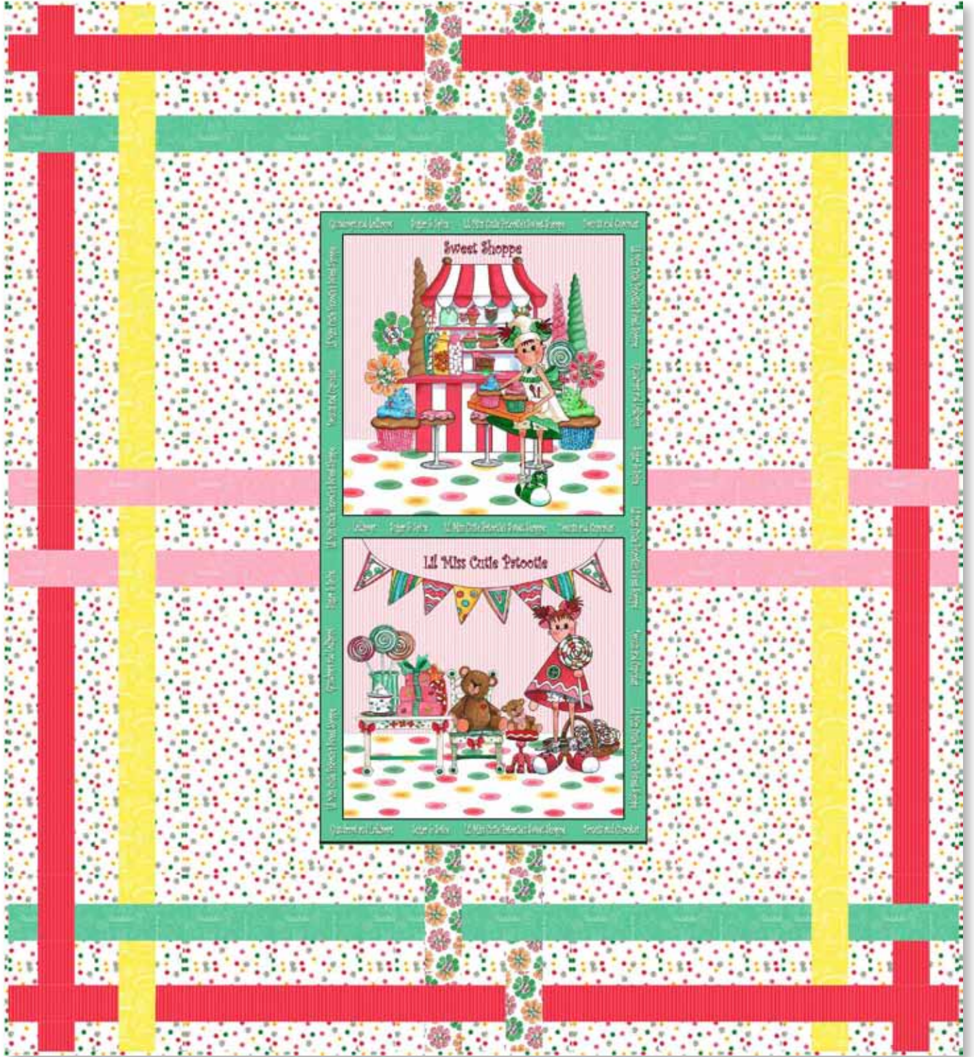
Designed By: Desiree Habicht of Desiree's Designs Finished Quilt Size: 64" x 71"