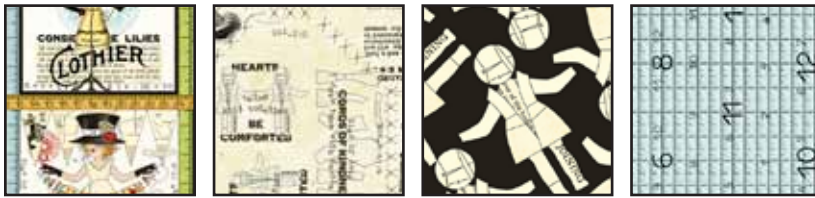
23064 EJ 23067 E 23068 J 23070 B (Binding)