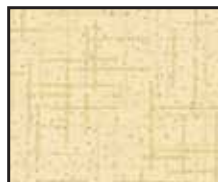
23078 EA Matrix