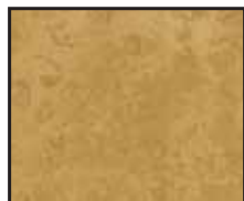
22542 AE Quilting Temptations