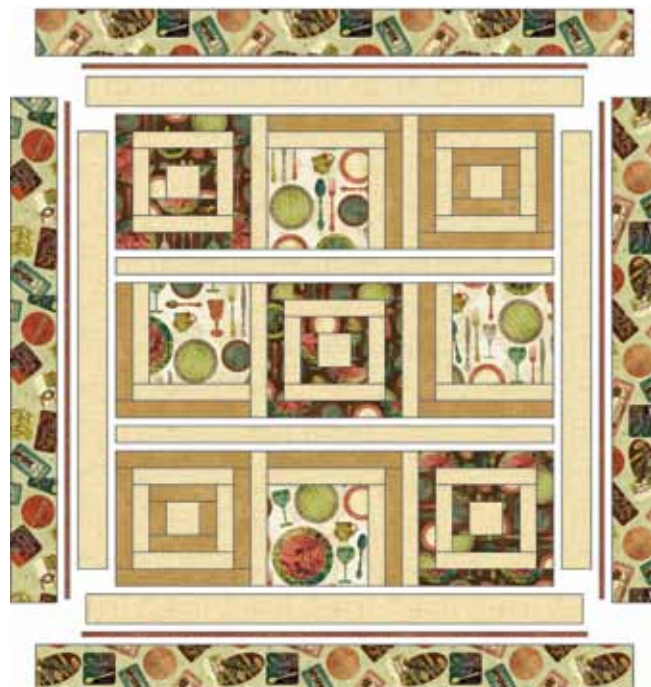
Quilt Layout Diagram

While all possible care has been taken to ensure the accuracy of this pattern, we are not responsible for printing errors or the way in which individual work varies.