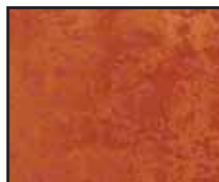
22542 T Quilting Temptations also binding