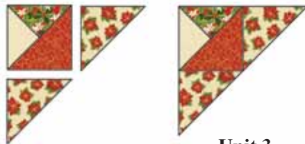
Unit 3 Red/Cream