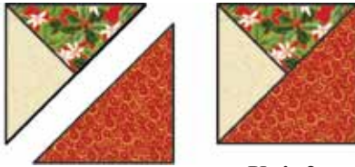
Unit 2 Red/Cream