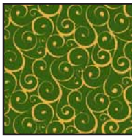
23299 F (Inc. Binding)