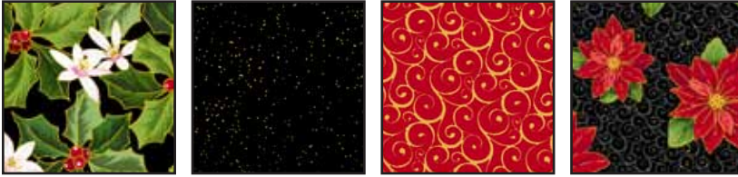
23298 J 23300 J 23299 R 23297 J (Inc. Binding)