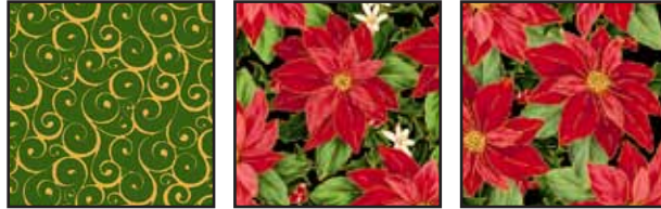
23299 F 23295 J 23296 JR