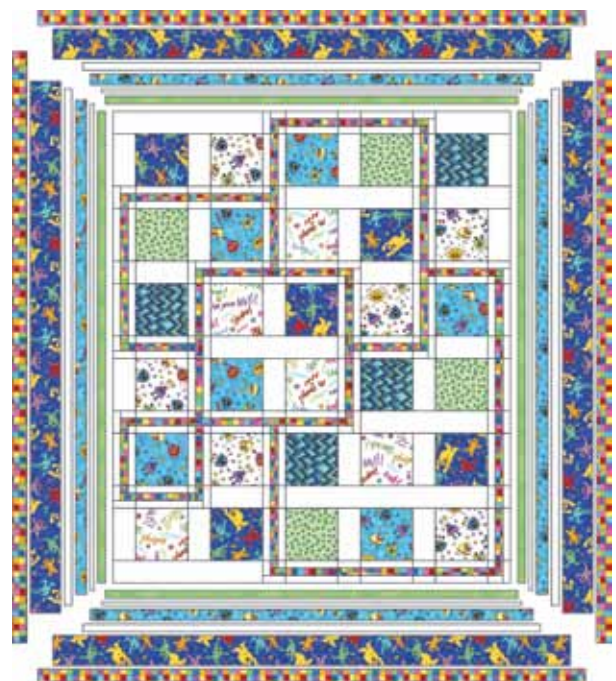
Quilt Layout Diagram