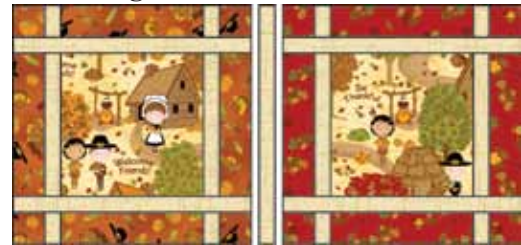
Quilt Center Row 2