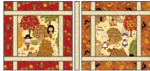
Quilt Center Row 1