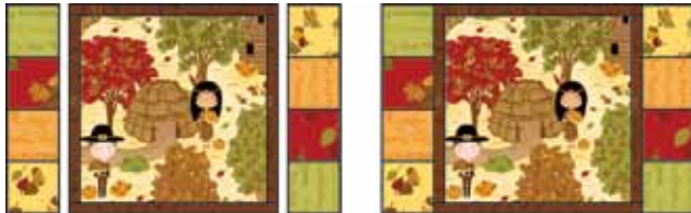
Placemat Diagram 3