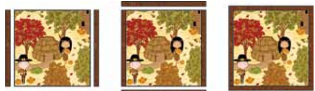
Placemat Diagram 1