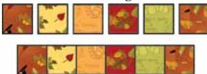
Placemat Diagram 4