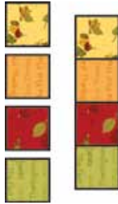
Placemat Diagram 2