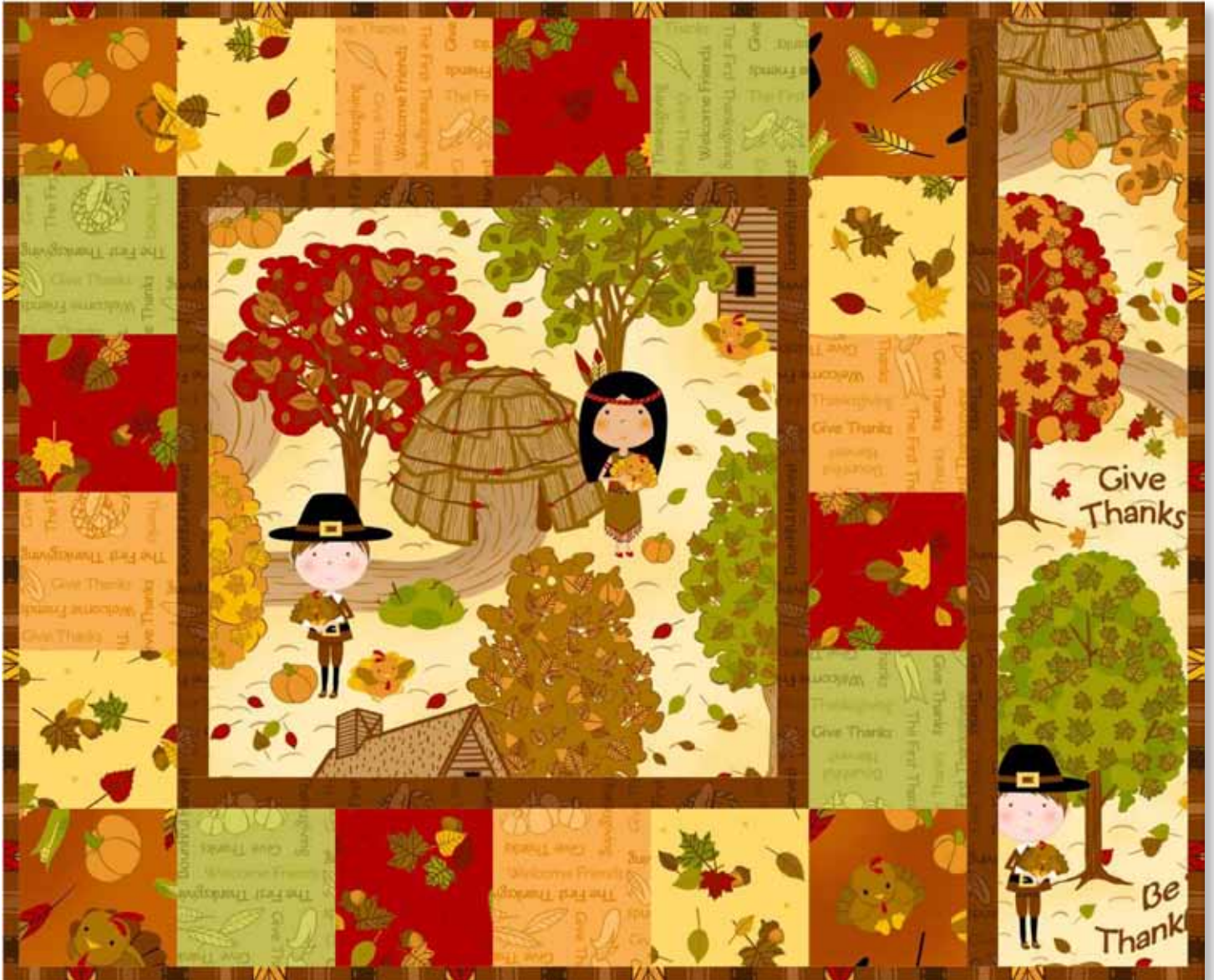
Designed By: Wendy Sheppard Finished Placemat Size (Set of 4): 18½" x 15"