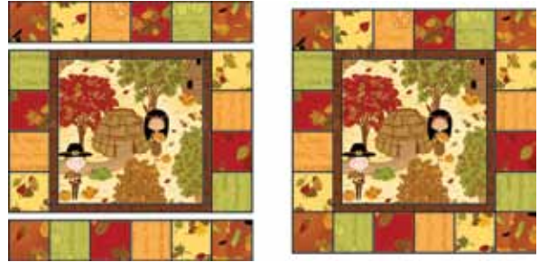
Placemat Diagram 5