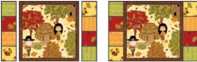
Placemat Diagram 3