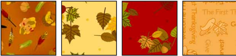
23316 T 23317 S 23317 R 23319 O