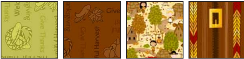
23319 H 23319 A 23315 S 23318 A (Binding)