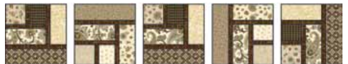
Block B Block A Block B Block A Block B