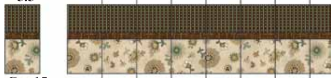
Diagram 6 5.5"