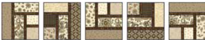
Block A Block B Block A Block B Block A