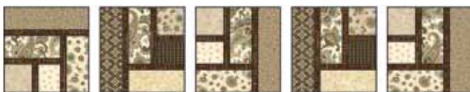
Block A Block B Block A Block B Block A