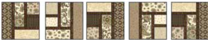
Block B Block A Block B Block A Block B