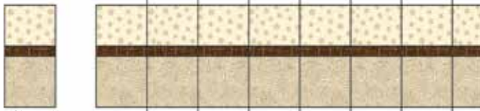
Diagram 1 5.5"