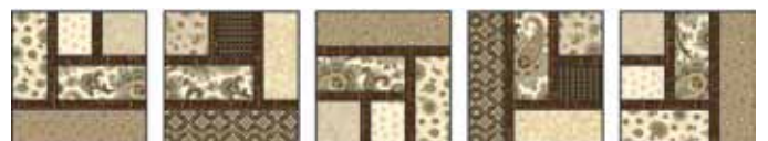
Block A Block B Block A Block B Block A