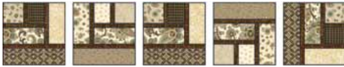
Block B Block A Block B Block A Block B