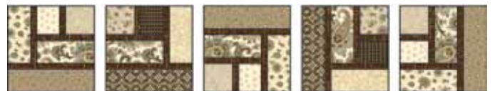
Block A Block B Block A Block B Block A