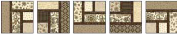
Block A Block B Block A Block B Block A