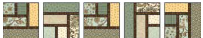
Block B Block A Block B Block A Block B