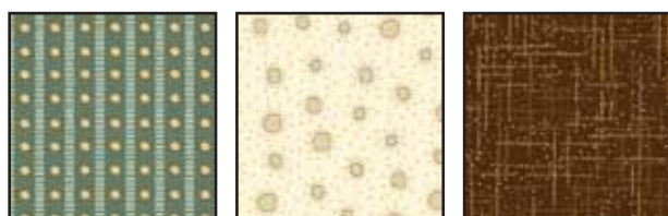
23367 Q 23368 E 23078 A (Inc. Binding)