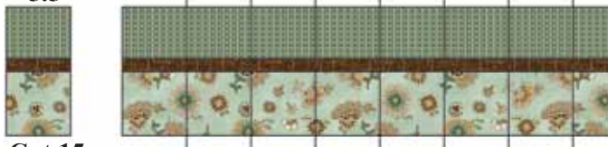
Cut 15 Unit 5