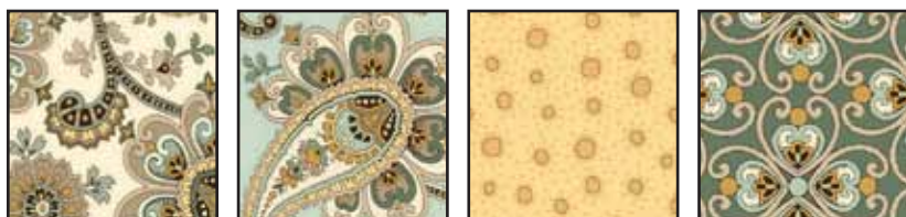
23363 E 23363 Q 23368 S 23365 Q