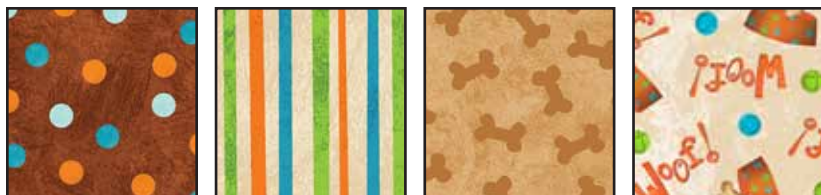
23143 A 23144 E 23142 A 23141 E