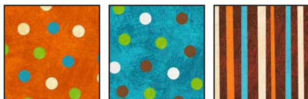
23143 O 23143 Q 23144 A binding