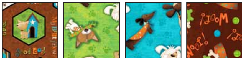
23139 A 23140 H 23140 Q 23141 A