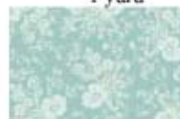
20692-Q 1 yard plus back