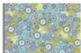
20689-Q 1 yard