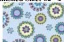
20691-W 3/4 yard