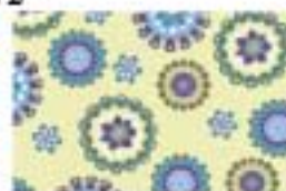
20691-H 3/8 yard