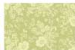
20692-H 1/2 yard