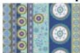
20690-BQ 1 yard