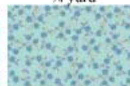
20695-Q 1 yard