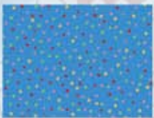
45247 B backing & binding