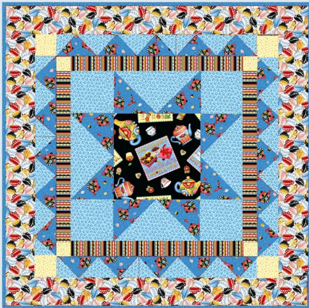
Finished size: 44" x 44"