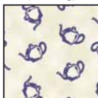
22421 EW (Binding)