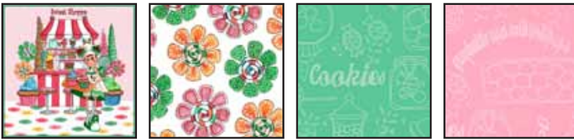
22896 PH 22899 Z 22900 H 22900 P