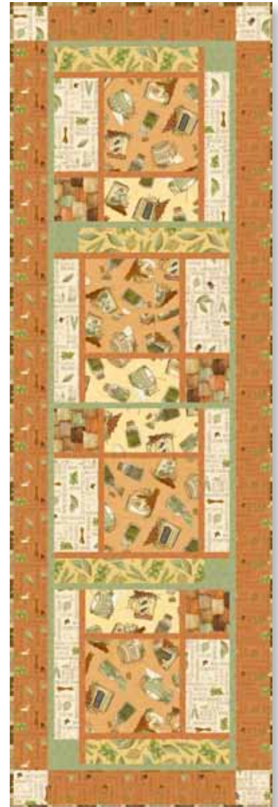
Finished Table Runner Size: 21" x 64½"