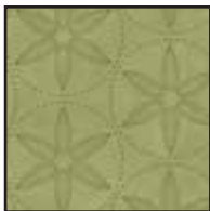
23032 H (Inc. Backing)