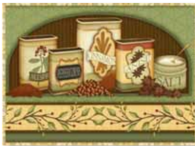
Finished Placemat Size: 18" x 13"

Designed By: Larene Smith, The Quilted Button, Mission Viejo, CA