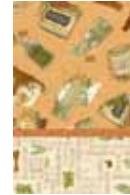
Example A Set A