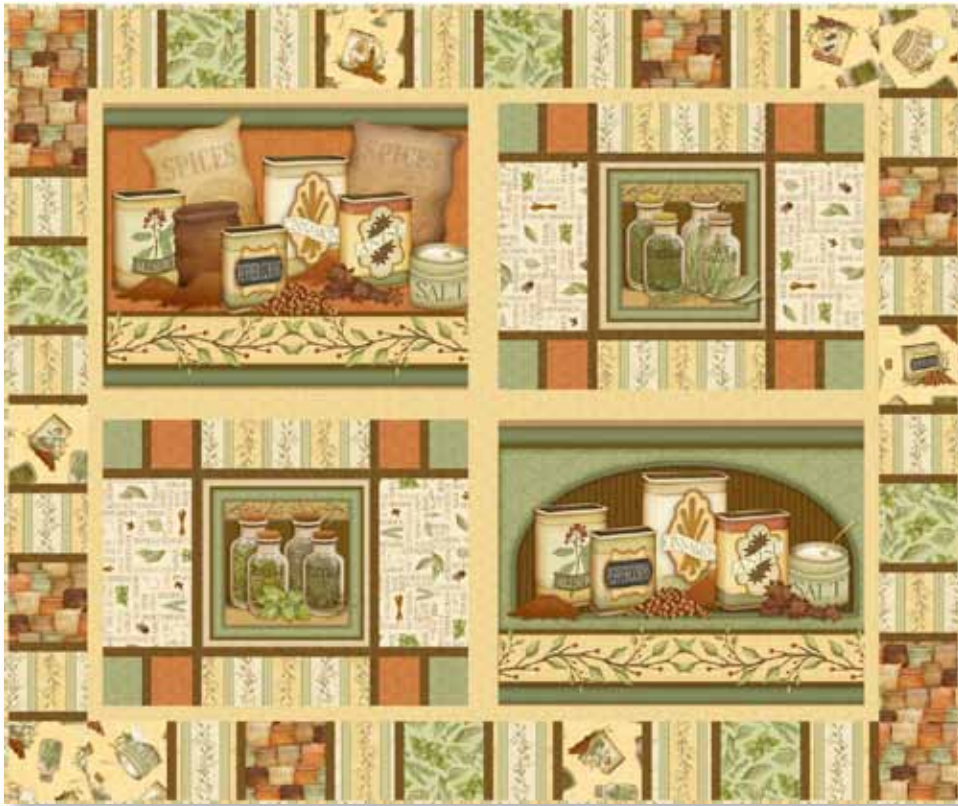
Finished Wall Hanging Size: 48½" x 40½"