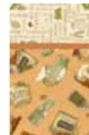
Example A Rotated Set A