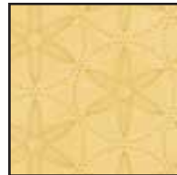
23032 S (Sashing & Inner Border)