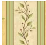
23030 ES (Inc. Binding)