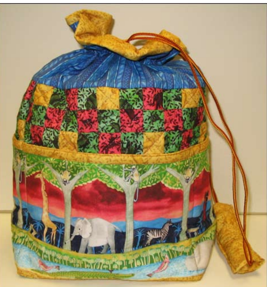
Finished Size: 10" x 6" x approximately 16"